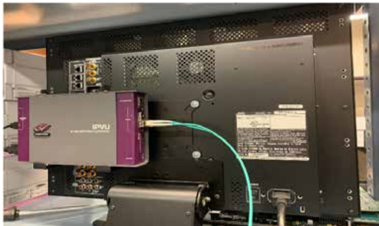
Figure 3: Zero Rackspace IPVU using Vesa-Mounting Kit

The IPVU has a mounting unit so it can be mounted on the back of displays in remote control rooms; essentially it's a zero rackspace unit. The output from the multiviewer is in JPEG XS, so low-cost 10G SFPs can be used in the IPVU. This allows for a reduction in the amount and cost of cabling in the control room, making for a cleaner and more efficient workspace.